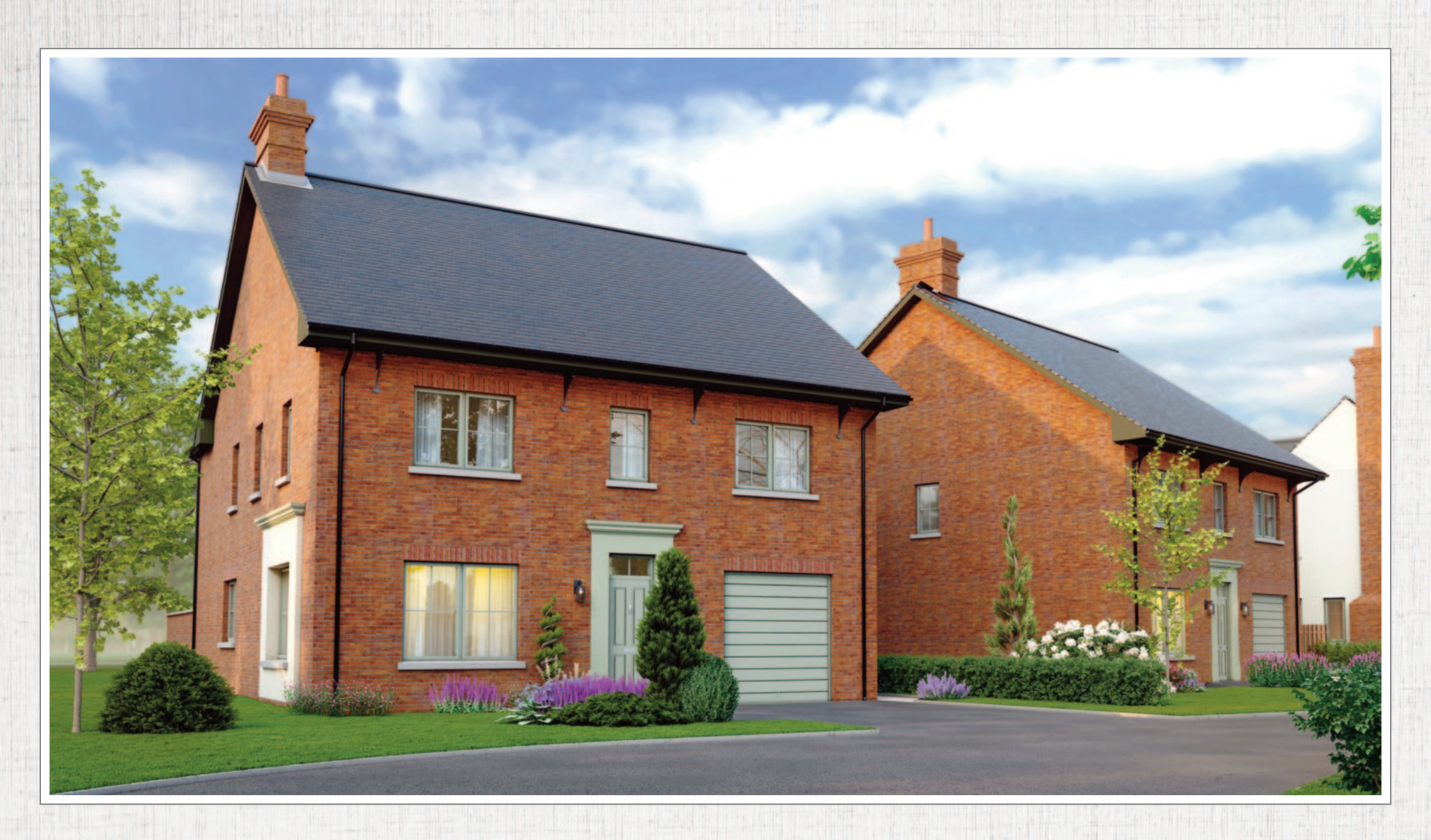
ABOVE: COMPUTER VISUAL SHOWING SITE 4A & 4B