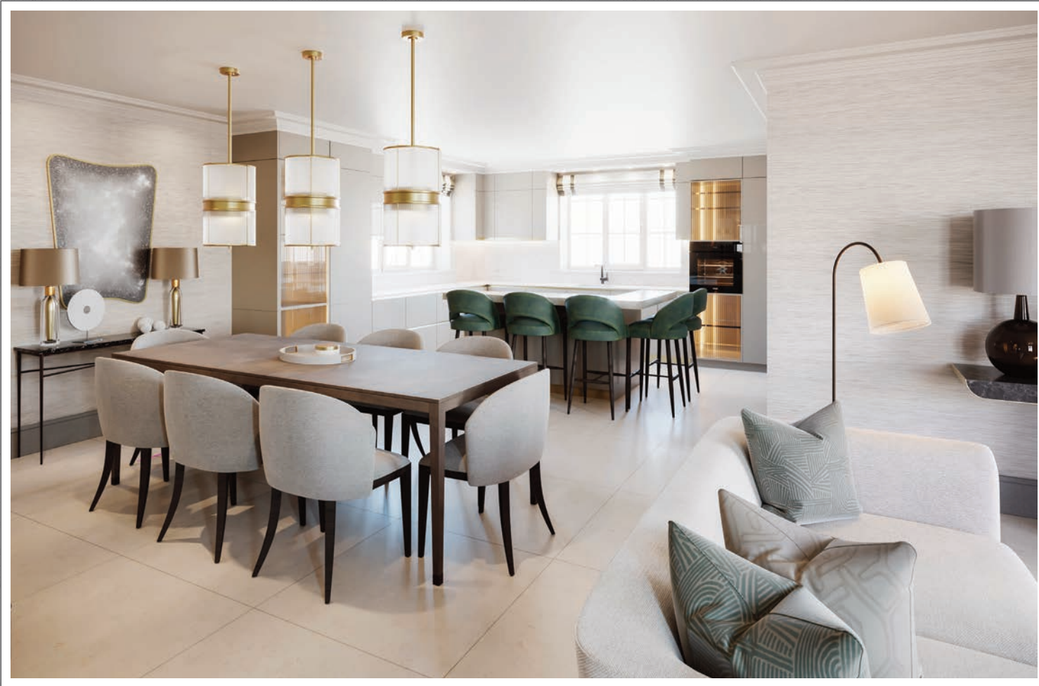
ABOVE: COMPUTER VISUAL FROM THE GATELODGE SHOWING LIVING / DINING / KITCHEN AREA OPPOSITE: COMPUTER VISUAL FROM THE GATELODGE SHOWING LOUNGE