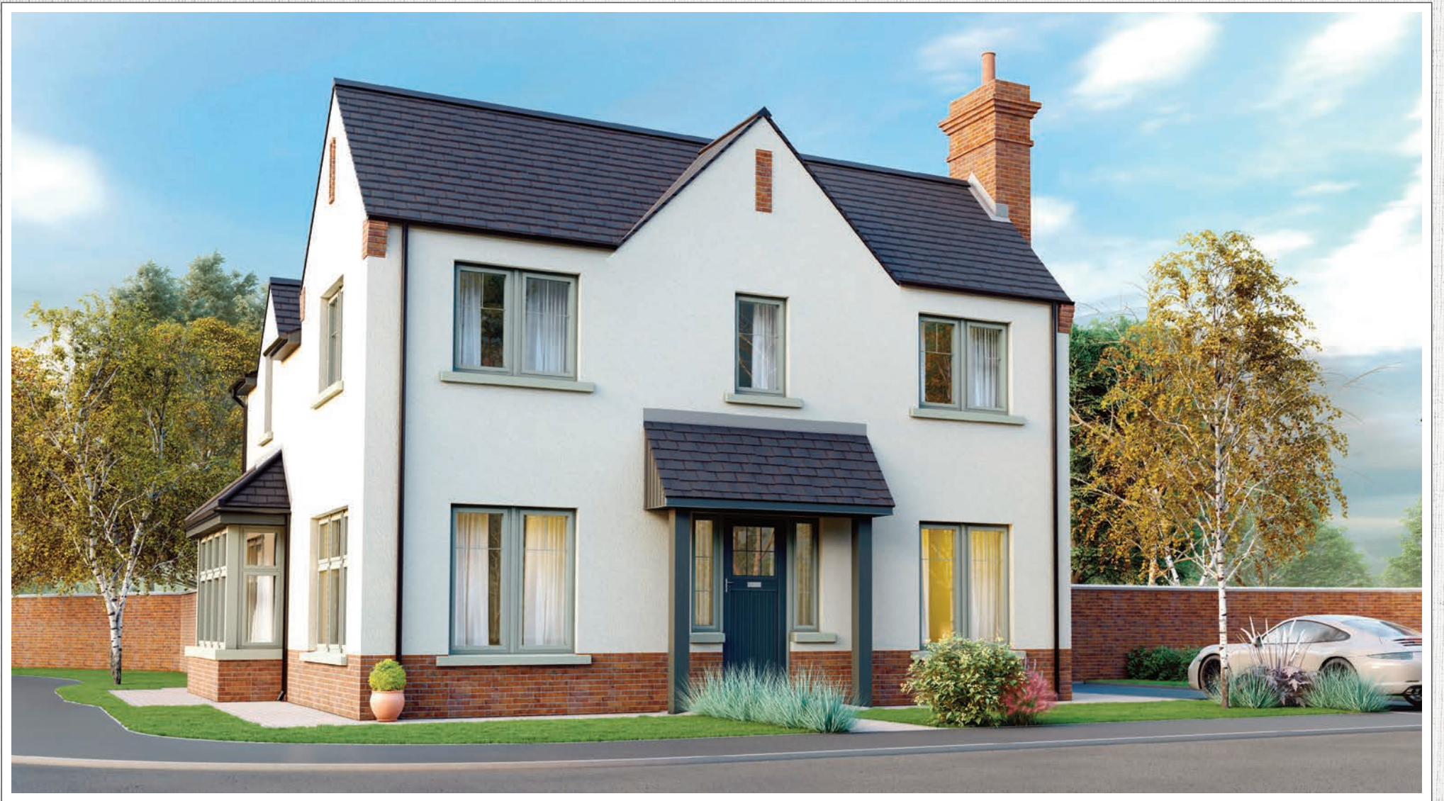
ABOVE: COMPUTER VISUAL SHOWING SITE 32