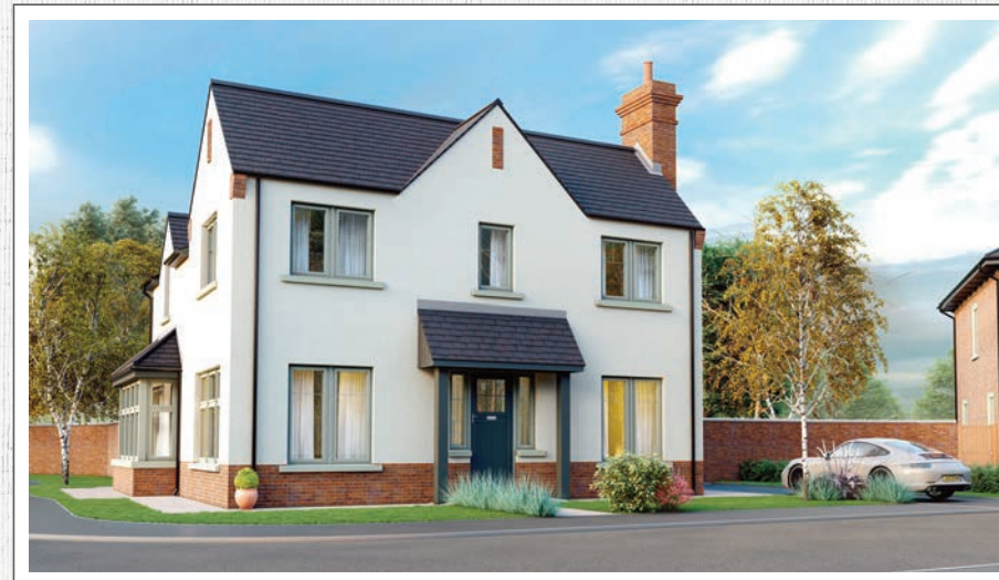
ABOVE: COMPUTER VISUAL OF SITE 32