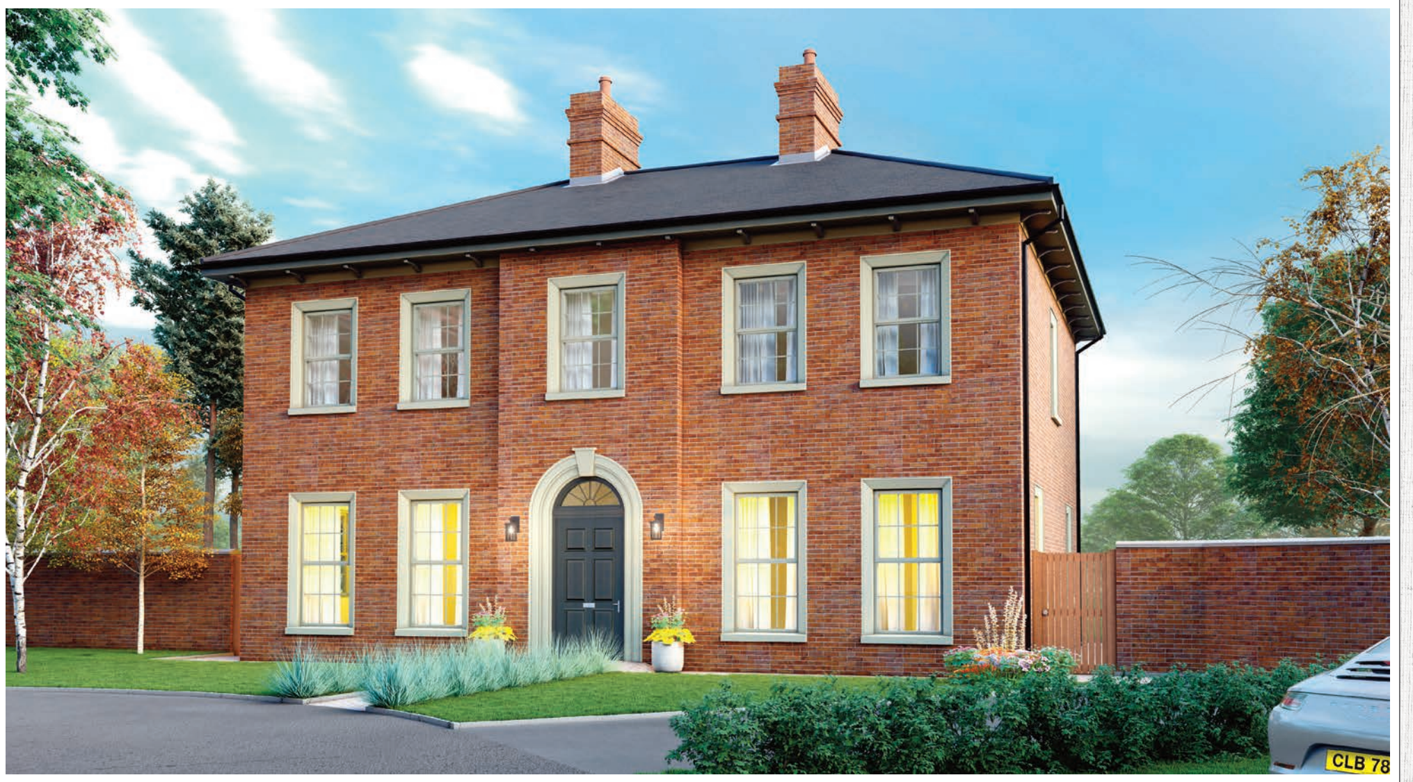
ABOVE: COMPUTER VISUAL SHOWING SITE 9