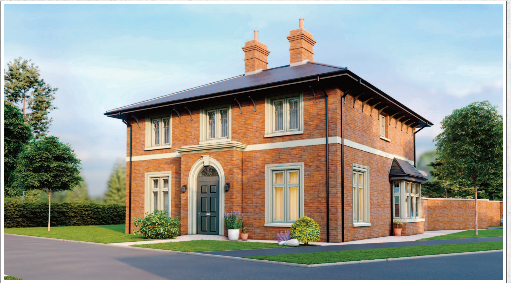
ABOVE: COMPUTER VISUAL OF THE DEANE HOUSE TYPE