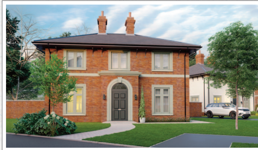
ABOVE: COMPUTER VISUAL OF DEANE HOUSE TYPE