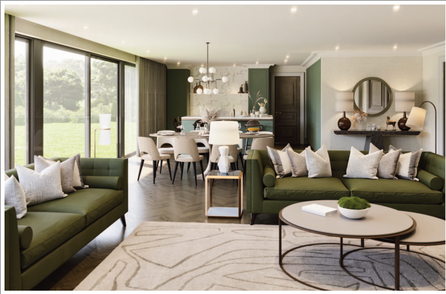
ABOVE: COMPUTER VISUAL FROM THE MULBERRY SHOWING LIVING / DINING / KITCHEN AREA OPPOSITE: COMPUTER VISUAL FROM THE GATELODGE SHOWING LOUNGE