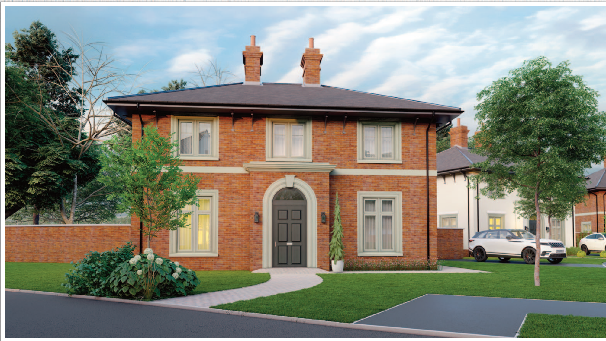
ABOVE: COMPUTER VISUAL SHOWING THE DEANE HOUSE TYPE