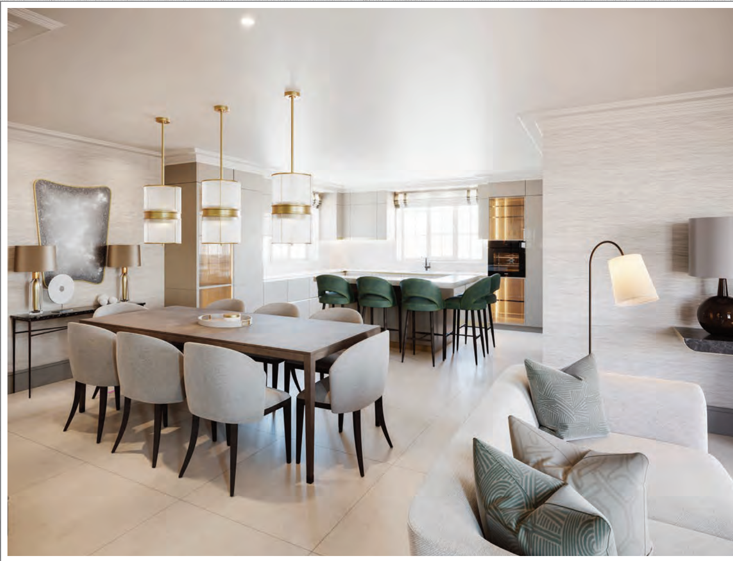
ABOVE: COMPUTER VISUAL FROM THE GATELODGE SHOWING LIVING / DINING / KITCHEN AREA OPPOSITE: COMPUTER VISUAL FROM THE MULBERRY SHOWING LOUNGE