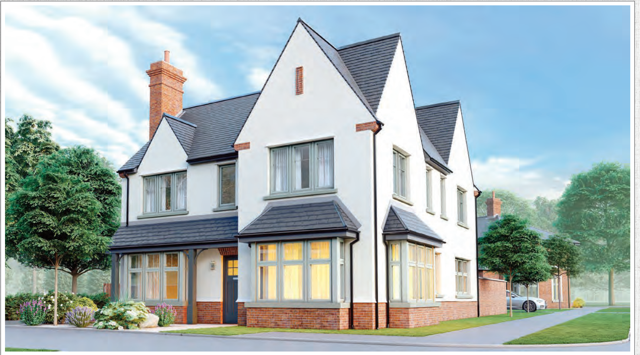
ABOVE: COMPUTER VISUAL OF SITE 4C