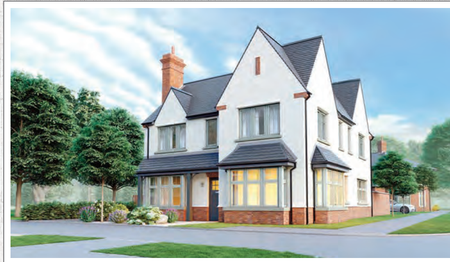
ABOVE: COMPUTER VISUAL OF SITE 4C